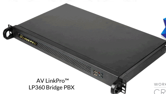
AV LinkPro™ LP360 Bridge PBX