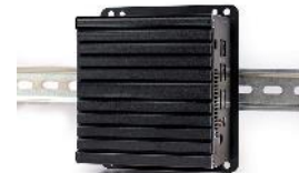
DIN Rail Mountable