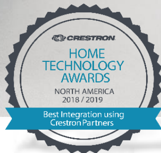
AV LinkPro™ LP200RNO

A residential communication experience that can be combined with Crestron Home™ for Audio, Video, Lighting, Shades, Climate controls. Thanks to a strategic partnership with AV LinkPro® and Crestron®, Video intercom with most any brand of door station plus enhanced features to advance any integration.